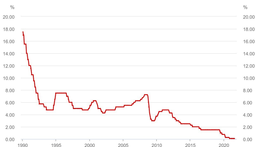
Graph of the Cash Rate Target

The RBA board has repeatedly stated that it expects interest rates to remain low for an extended period. So it was no surprise earlier this week that interest rates remained unchanged for the 8 th month in a row. To see just how low rates are in historical terms, consider the following graph: