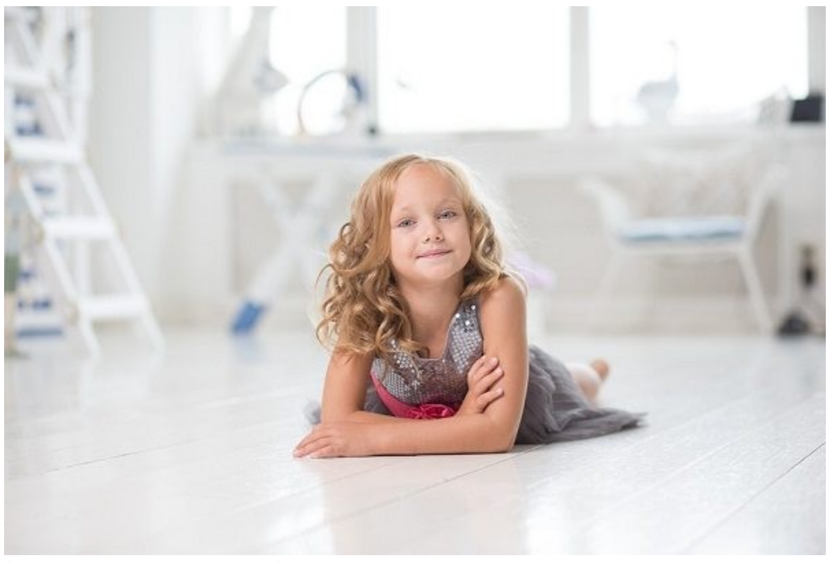
(First published 24 February 2017)

If you already own a home, then the last 20 years have been wonderful. For you. But what about your kids? Around Australia, house prices have risen by more than 500% in the last 20 years. How will your kids be able to buy their home?