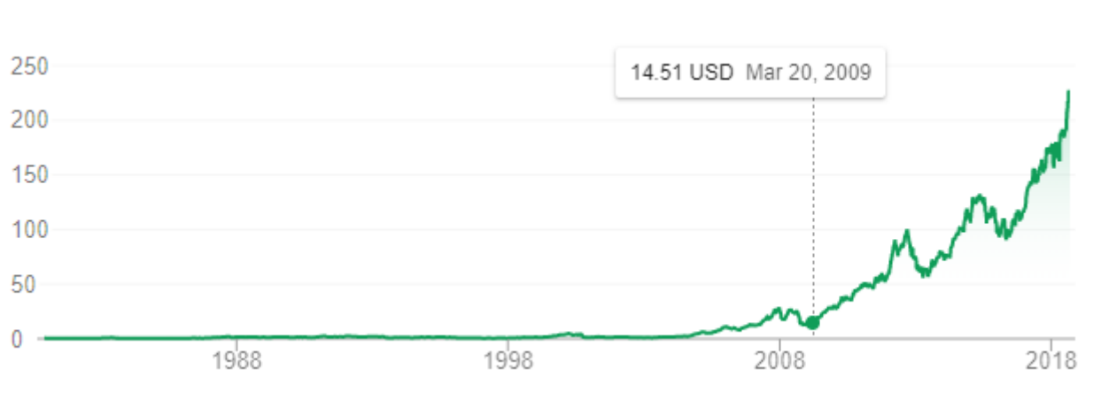
Apple Shares Since Formation

In August, Apple became the first company whose total shares were valued at more than US $1 trillion. If you want to see the impact of these tech giants on the American market, consider this graph showing the lifelong sharemarket performance of Apple shares. Once again, the source is Google: