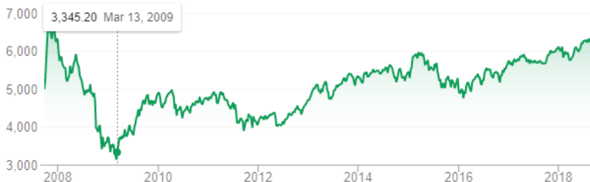
ASX 200 Ten Years to 2018

growth enjoyed by U.S.-based investors. In fact, the average U.S.-based investor has done four times better than the average Australian-based investor. Here is how things looked in Australia: