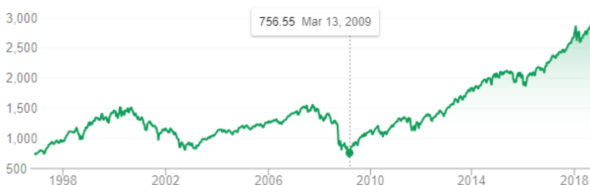
S&P 500 (US Market) Last Twenty Years

If you had been one of the really brave few who bought a broad-based portfolio of shares on 13 March 2009, you have almost quadrupled your wealth since then. Once again, here is how it looks on Google - note the colour has turned to green!