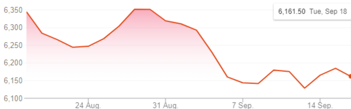
ASX 200 August-September 2018

Between the middle of August in the middle of September, the ASX 200 fell by 3.15%. Here's how it looked on Google (in case you're wondering, red usually means bad!):